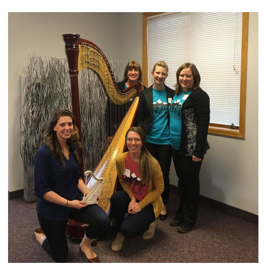
Mile High Chapter Board at the Harp Symposium