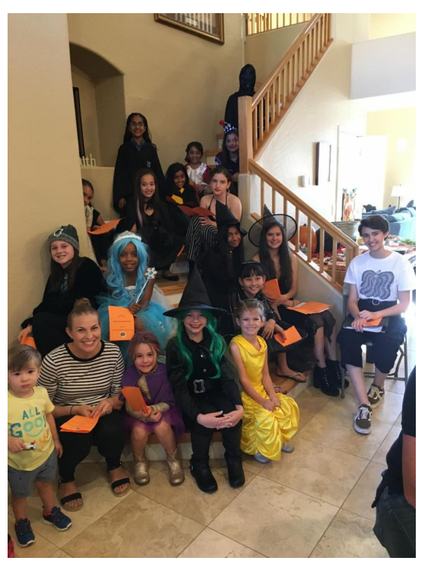
Halloween Recital Participants

Hosted at a student's home, a combination of harp and piano students dressed up and played Halloween themed tunes.