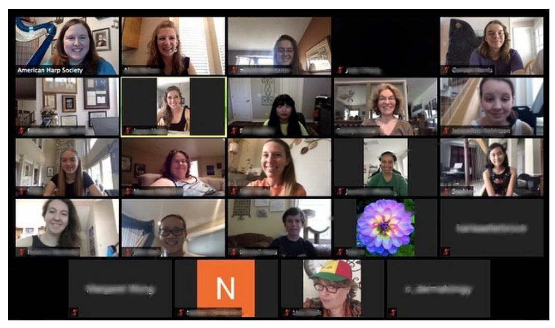
Mile High Chapter Virtual Regional Harp Recital 2020

As musical performances continued to move to an online platform, the Mile High Chapter joined this trend to do our part in maintaining safe social distancing practices while still elevating our local harp community. We wanted to give our community of harpists a much needed "live" performance opportunity to share their music with each other in a virtual recital. There were thirteen performers and numerous friends and family of chapter members were in the online Zoom audience.