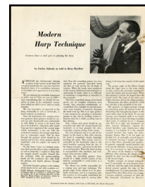
Article about Modern Harp technique written by Carlos Salzedo.